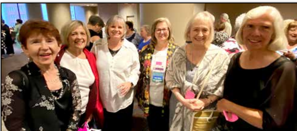
Members of the ASO delegation are shown just before the final event of the Convention on Saturday, July 16.