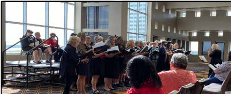
Members of the Arkansas delegation attended the "Celebration of Life" ceremony at 9:00 am.