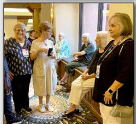
Members of the ASO delegation are shown as they waited for the last banquet of the Phoenix Conference to begin.