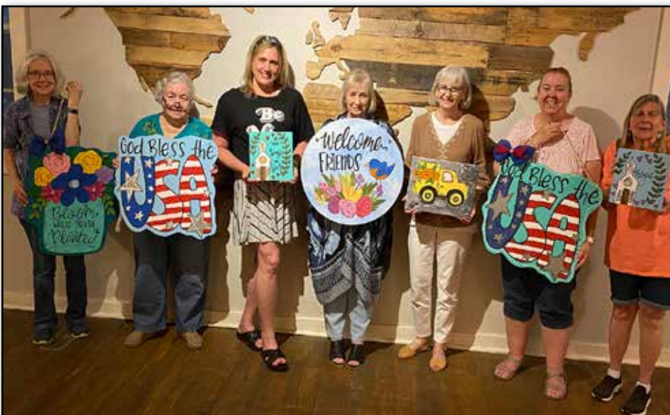
Mu Chapter in Saline County had a summer paint party on June 20 at Art 101 in Bryant.