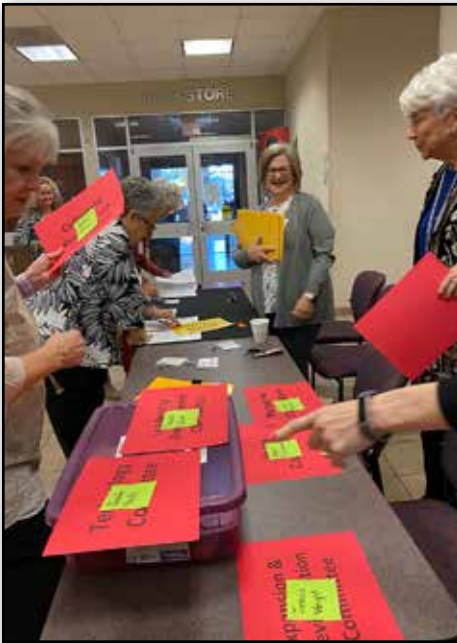
Photo Highlights from the ASO Fall Conference