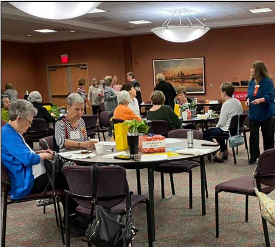
Below, on Saturday, October 14, members visit before the ASO Fall Conference starts.