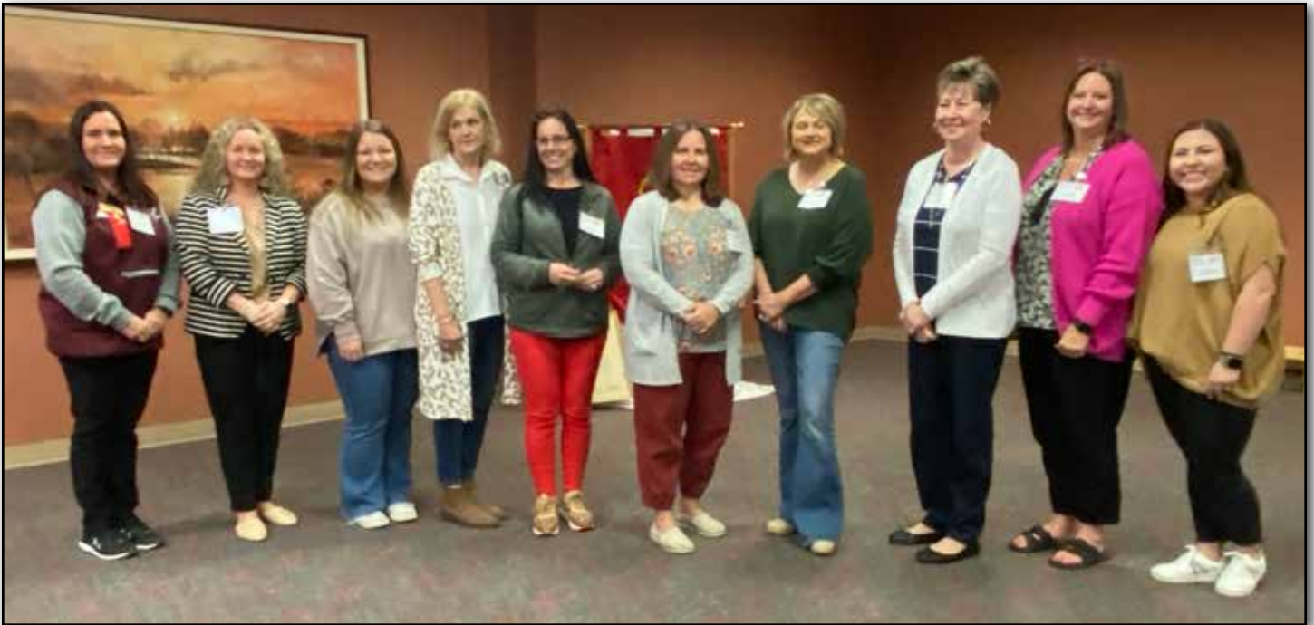
Shown above are members attending the ASO Fall Conference for the first time.