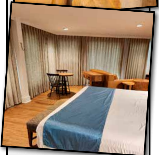
Guest cabin accommodations at the Ozark Folk Center have been renovated and are ready for the ASO Convention.