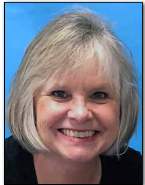
ASO Candidates continued page 3...

is a capable leader...[who] has worked tirelessly and conscientiously in every position she has held."