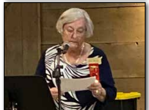
All the photos shown on this page are from the Area 1 meeting on April 23.