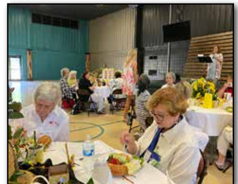
Members were treated to a style show during the luncheon.