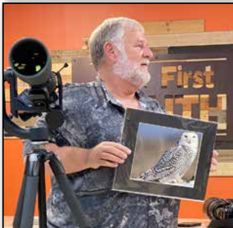
The three photos above are all from breakout sessions held during the Area 2 meeting.