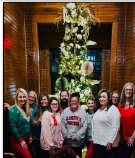
The December meeting of Epsilon Gamma Chapter was a holiday party. (For more from Epsilon Gamma see page 7.)

AREA 4: April 13, 2024 Sheridan High School Sheridan, AR