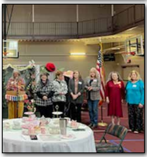
The photos featured on this page are from the Area 1 meeting.

Left are the members of the Clarksville Middle School Beta Club who served the "High Tea with DKG" to the Area 1 members.